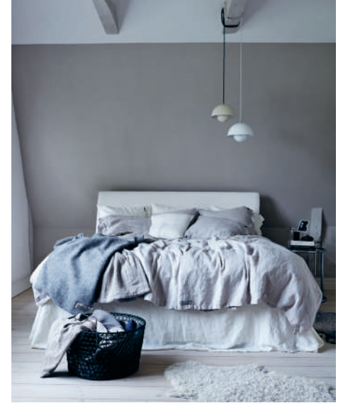
0195 LIGHT GREY