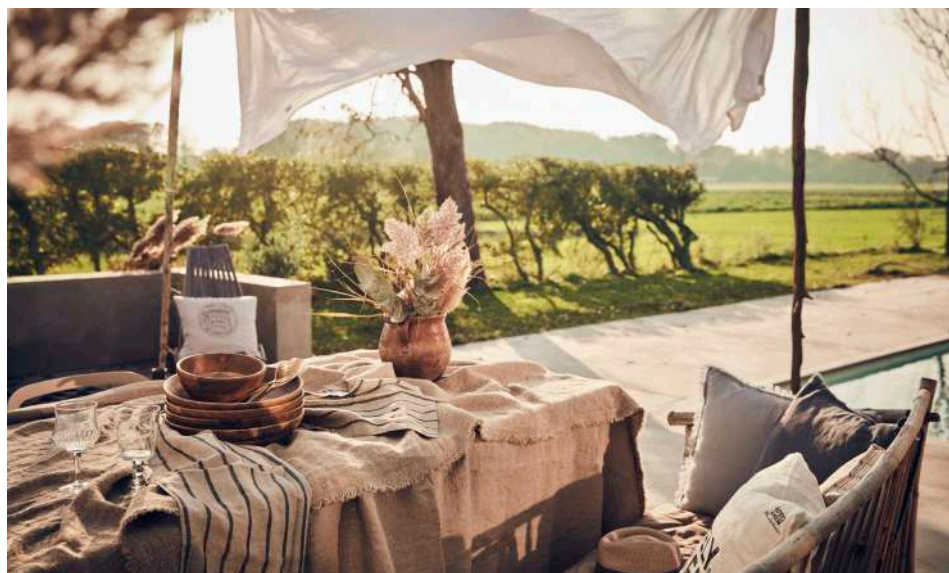
2089 RUSTIC NATURAL BEIGE & 0898 STRIPE BLACK