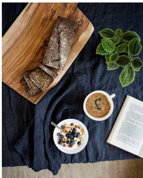
0197 DARK GREY