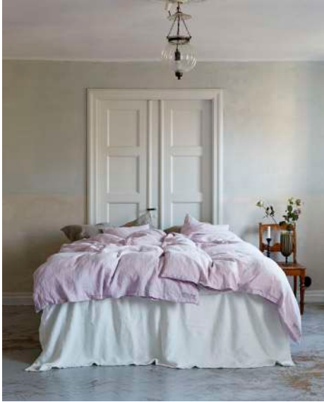
0141 DUSTY PINK