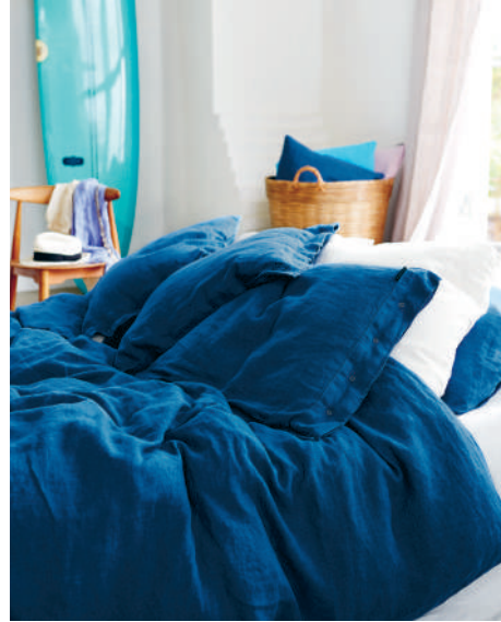
0178 DENIM BLUE