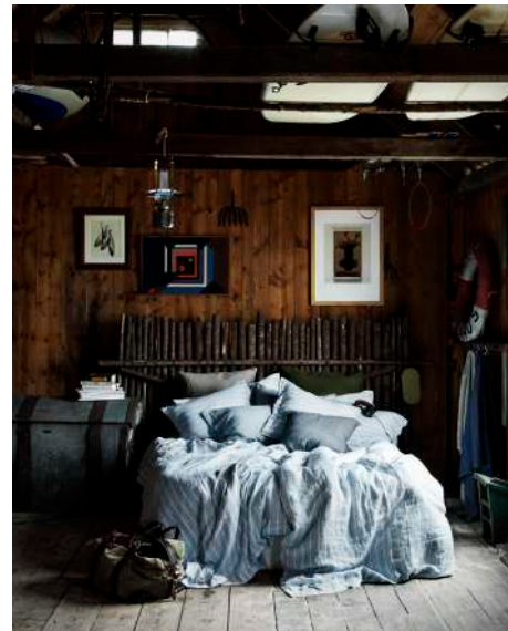
0879 STRIPE SKY

Our bed linen is not only extremely beautiful, it is also incredibly comfy. We promise you: it will be hard to wake up and leave the bed in the morning.