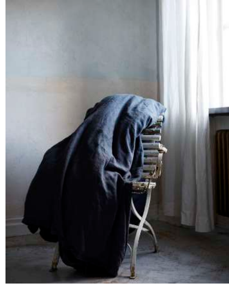
0197 DARK GREY