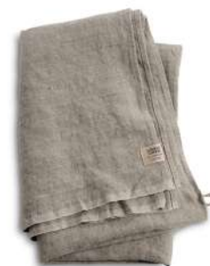
0189 NATURAL BEIGE