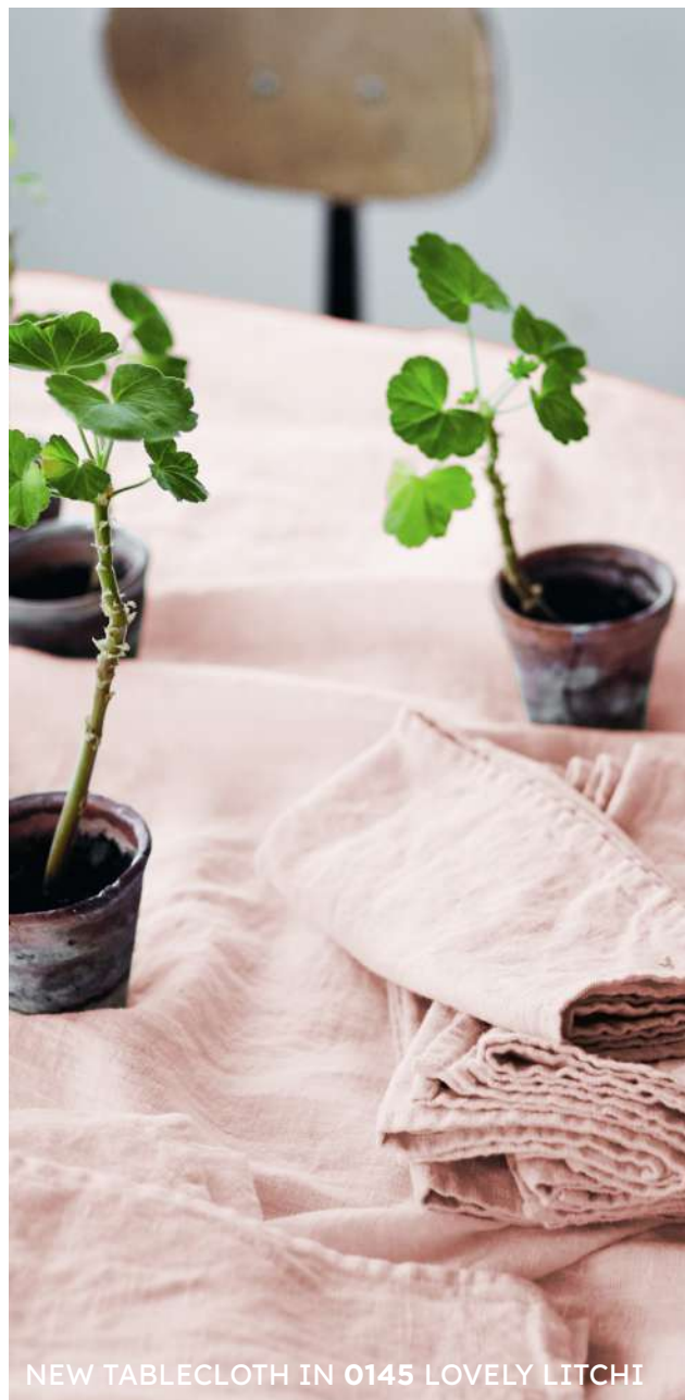
NEW TABLECLOTH IN 0145 LOVELY LITCHI