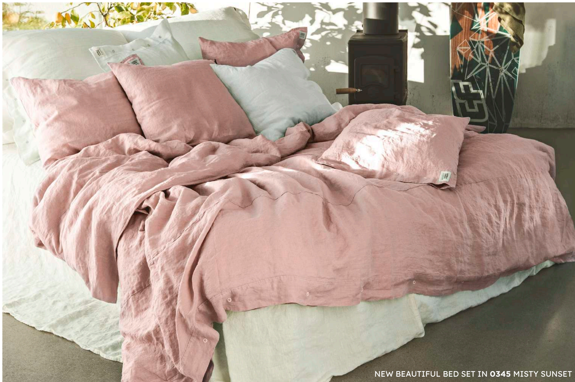
NEW BEAUTIFUL BED SET IN 0345 MISTY SUNSET