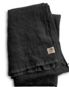
0197 DARK GREY